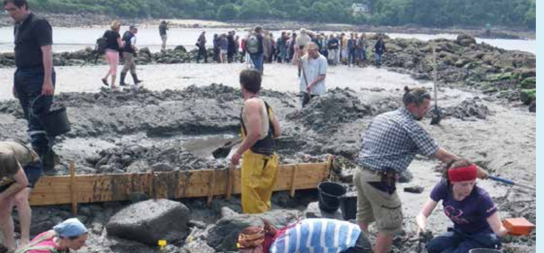
The UK and French partners working on the Servel Lannion fishtrap site in June 2013, an open day was also held during the excavations and this image shows several visitors being shown around the site

The UK partners have continued to record the submerged Mesolithic landscape at Bouldnor Cliff, recovering worked flints and environmental material which can help us to understand the formation of the Solent.