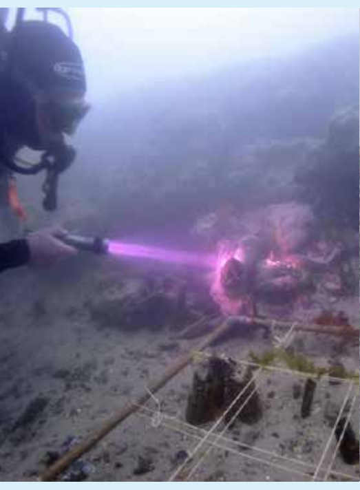
The UK partners continued to survey the submerged Mesolithic site of Bouldnor Cliff, this particular section is being impacted by rapid erosion

This Activity has produced a database with ranked examples that can be integrated using GIS with the results from Activity Two, to show their potential to add to understanding of coastal climate change across the 2-Seas region. The case studies will apply, test and review methods of investigating coastal climate change, and the results will be used within the project best practice guide to show how archaeological sites can be used to support the management of coastal risks and develop policies to manage coastal change.