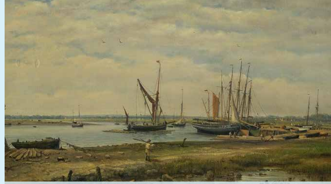
Painting by John Moore 'Slaughden Quay', 1883.

Activity Two of the Arch-Manche project is examining how historical works of art (coastal landscape paintings, watercolours and prints) painted between 1770-1940, along with historic photos, maps and charts can be used as a qualitative tool to support our understanding of long-term coastal change across the Channel – Southern North Sea region.