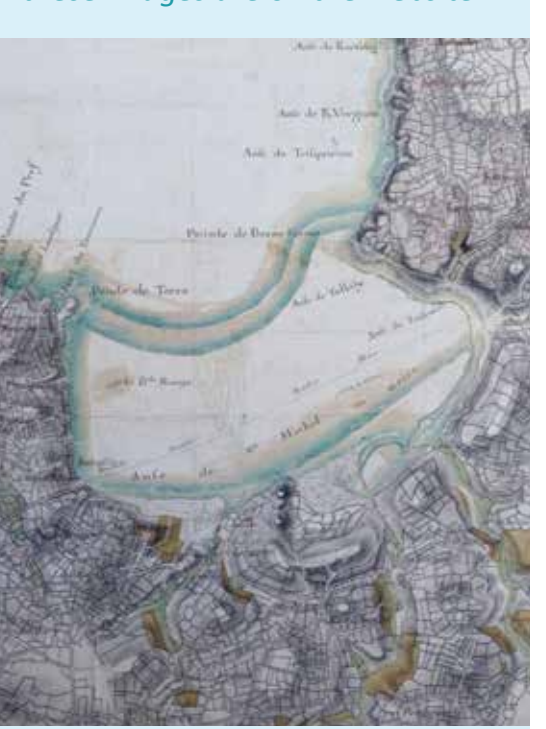
The French partners have continued to analyse historic maps charts and photos, above is a map of the St Michel en greve bay showing the existence of a Roman road which was later used as a religous medieval trackway.

The project is consulting a range of sources including maps, charts, historic photographs, and postcards. All partners are contributing to this Activity and gathering images which can be assessed and scored for their potential to provide data on coastal change, this information will then be added to the project database. Deltares are also focusing on palaeogeographic creating reconstructions of the South-West Netherlands, to show landscape change over time. A selection of these images are on the website.