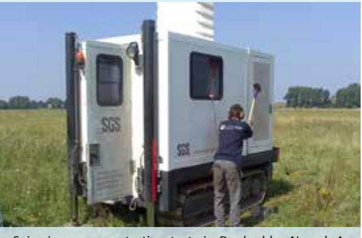
Seismic cone penetration tests in Doelpolder Noord. A sledge hammer and heavy beam were used to create acoustic waves (Image Courtesy RCMG).

This project is demonstrating how archaeology, art and maritime coastal heritage can be used to show long-term patterns of coastal change and the impact on human settlement. Study of this data allows understanding and modelling of past reactions to climate change to help with planning for the future. The results are important for 'Integrated Coastal Zone Management' (ICZM) and will inform sustainable policies for adapting to coastal climate change. This project is timely due to predicted increases in erosion, flooding and instability affecting Channel coasts. The project will both benefit from and contribute to developing practice in the study of submerged and intertidal paleaeoenvironment archaeology, and intertidal coastal features.